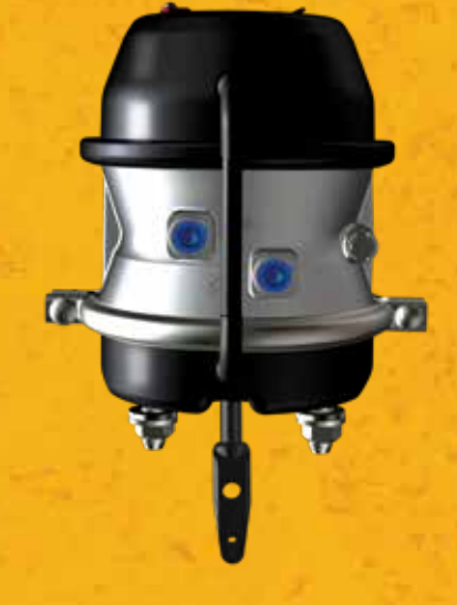
Model Shown: TR-LP3T (w/welded yoke - optional)