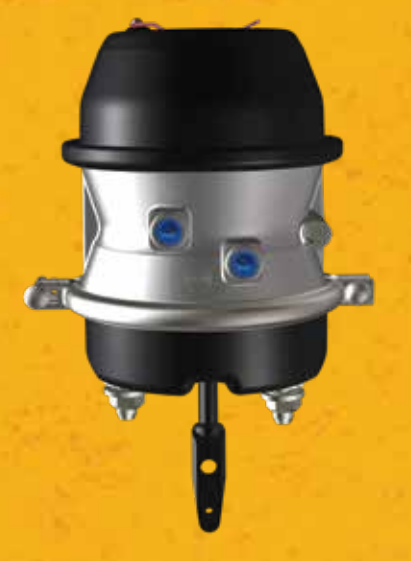
Model Shown: TR-LP3 (w/welded yoke - optional)