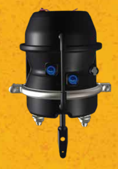
Model Shown: TR-LP3TS (w/welded yoke - optional)