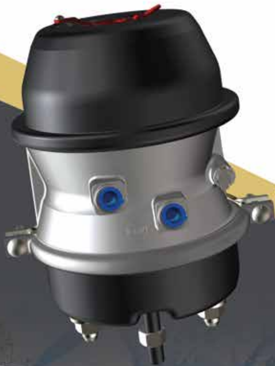
TR-LP3THD Model Shown

PROVIDES EXTRA PARKING FORCE WHEN YOU NEED IT MOST