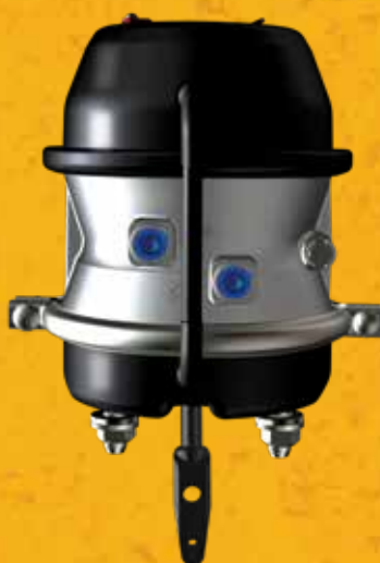
Model Shown: TR-LP3T (w/welded yoke - optional)