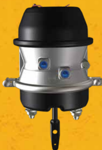
Model Shown: TR-LP3 (w/welded yoke - optional)