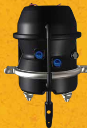
Model Shown: TR-LP3TS (w/welded yoke - optional)