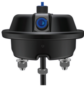
CS16LH (shown) Totally sealed

Note: All dimensions shown in inches and are subject to design change.