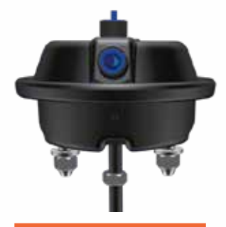
CS16LH (shown) Totally sealed

Note: All dimensions shown in inches and are subject to design change.