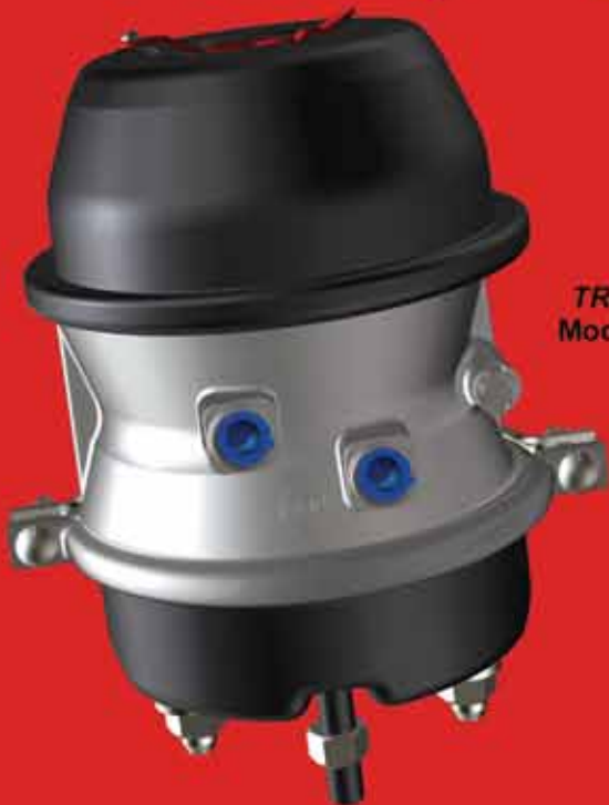
TR-LP3THD Model Shown

PROVIDES EXTRA PARKING FORCE WHEN YOU NEED IT MOST.