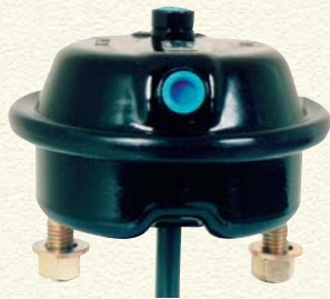
CS16LH (shown) Totally sealed

Note: All dimensions shown in inches and are subject to design change.